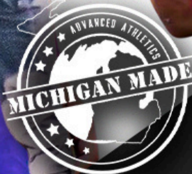
MYKUL CAMPBELL DB | DECATUR CENTRAL HS | CO 2026